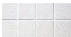
Second Look I panel – Scoring creates nominal 12" x 12" squares