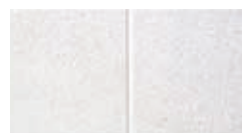
Second Look II panel – Scoring creates nominal 24" x 24" squares