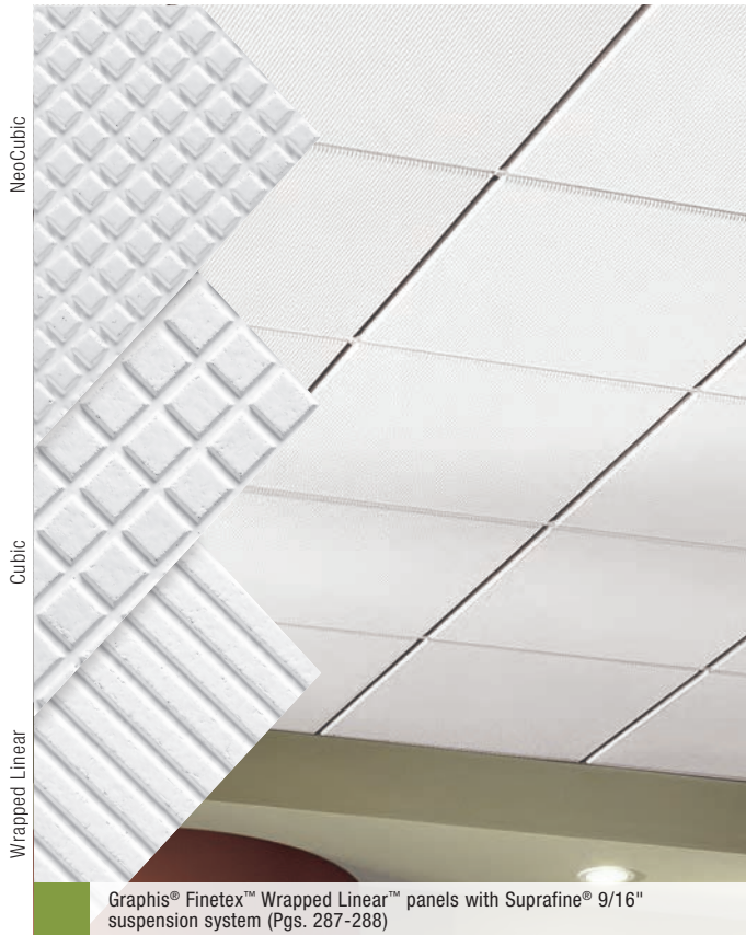
Graphis® Finetex™ Wrapped Linear™ panels with Suprafine® 9/16" suspension system (Pgs. 287-288)

Cubic Beveled & Linear Beveled coarse texture