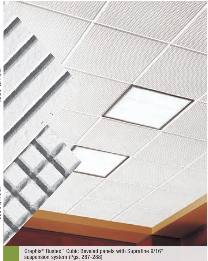
Graphis® Rustex™ Cubic Beveled panels with Suprafine 9/16" suspension system (Pgs. 287-288)

These panels offer bold geometric and linear patterns with unique visual designs.