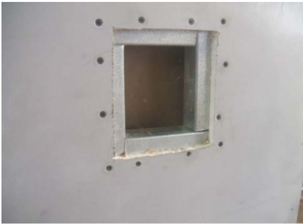
Figure 3. Frame Cutout