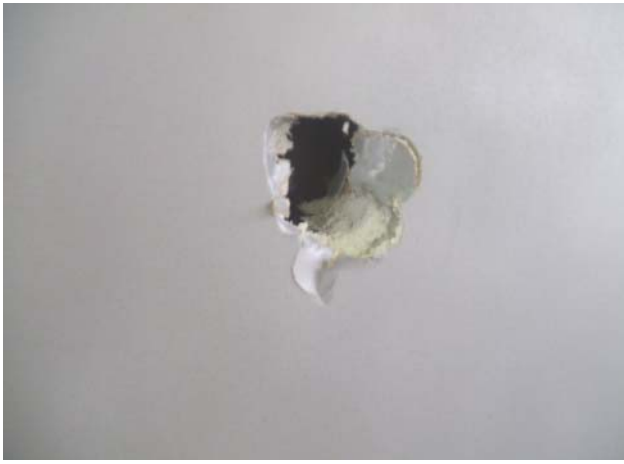
Figure 1. Damaged Gypsum Board