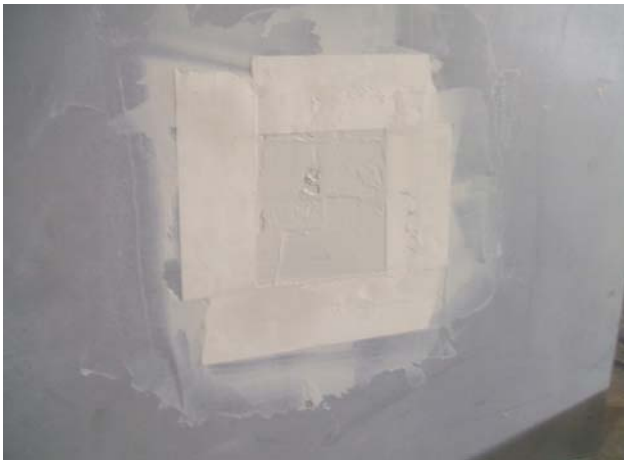
Figure 5. Tape and Finish Patched Area