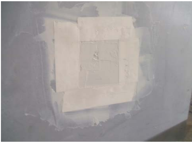
Figure 5. Tape and Finish Patched Area