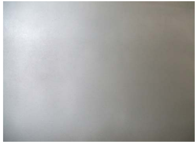
Figure 6. Redecorate Patched Area

This document may be revised or withdrawn from circulation at any time. The status of the document should be verified by the user prior to following any recommendations contained herein. To verify that you have the most current edition of the document, access the Gypsum Association website at: www.gypsum.org .