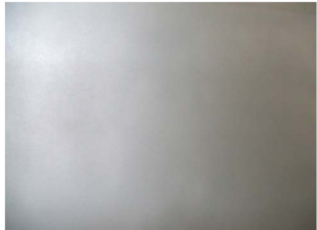
Figure 6. Redecorate Patched Area

This document may be revised or withdrawn from circulation at any time. The status of the document should be verified by the user prior to following any recommendations contained herein. To verify that you have the most current edition of the document, access the Gypsum Association website at: www.gypsum.org .